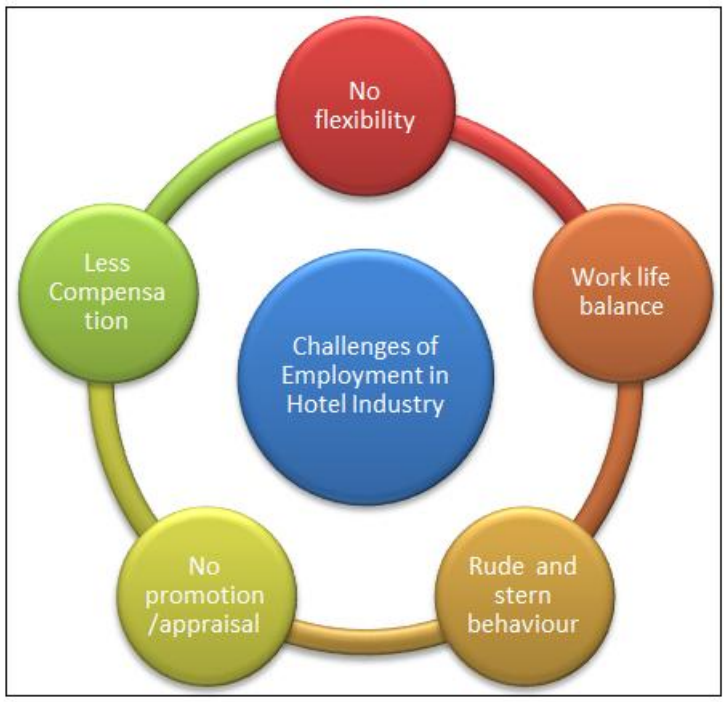
Illustration-1: Challenges of Employment in Hotel Industry

Unlike other industries, the hotel industry also holds its own drawbacks, i.e. long working hours, less compensation, no promotion/appraisal. Rotating shifts also generate problems for work life balance, thus there is uncertainty of career development/growth. The rude and stern behaviour of superiors, no flexibility in job timings as well as availing leaves as per own choice creates mental trauma. Lack of communication amongst senior, middle management and line staff leaves the employee disgruntled. All the communication to lower level employee remains downward without any choice. Communication made by lower level employees is never taken in upward direction. "If an organization has made significant investment in training and developing its employees, that investment is lost when employee leaves"