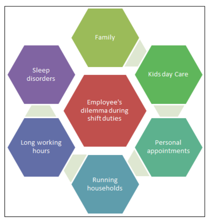
Illustration-2: Employee's dilemma in hospitality industry during shift duties

In hotel Industry shutters never closes, as this Industry offers hospitality to its patrons 24X7X365 days. The practices of round-the-clock or 24/7 operations can significantly influence shift worker alertness (and hence safety) and performance [24]. While working in shifts employee shift changes weekly/fortnightly/monthly depending upon the hotel policy thus the staff employed in hotel industry remains worried about their family, kids day-care, personal appointments, and running their households. Generally, for Employees shift work remains stressful due to constant change in shifts. Shift work has been shown to negatively affect workers. Due to shift timings and long working hours employee health also has negative impacts, i.e. Sleep disorders resulting in Insomnia and excessive sleep disorder.