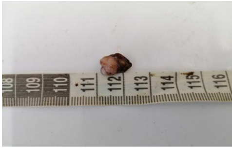
Fig-1: Macroscopic image of the subcutaneous nodule of the sacral region