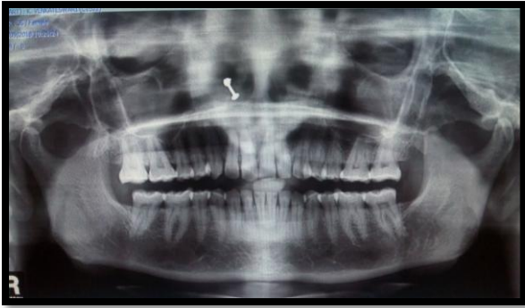
Fig-6: Panoramic radiograph of the patient