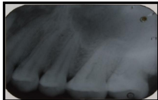
Fig-4: Intra oral peri apical radiograph of the patient