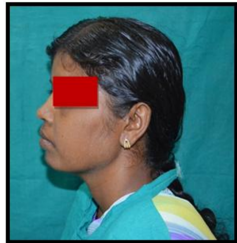
Fig-2: Left lateral side of the patient