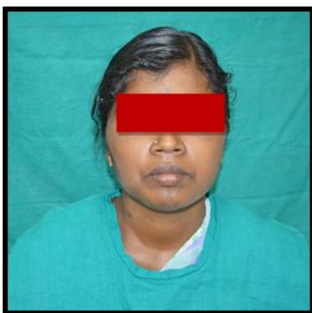
Fig-1: Facial profile of the patient

Culture and sensitivity report revealed that the patient was resistant to most of the antibiotics that are used in routine clinical practice like pencyllin, co-trimoxazole, methicillin, cloxacillin, linezolid, teichoplanin, piperacillin, tazobactam, vancomycin. However, intermediate response to ofloxacin was reported.