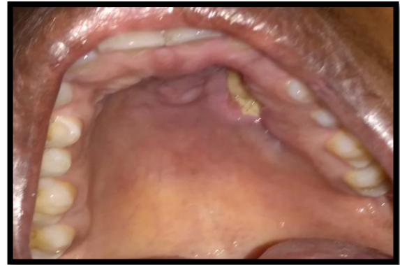
Fig-9: Purulent discharge in the posterior hard palate during the initial visit of the patient