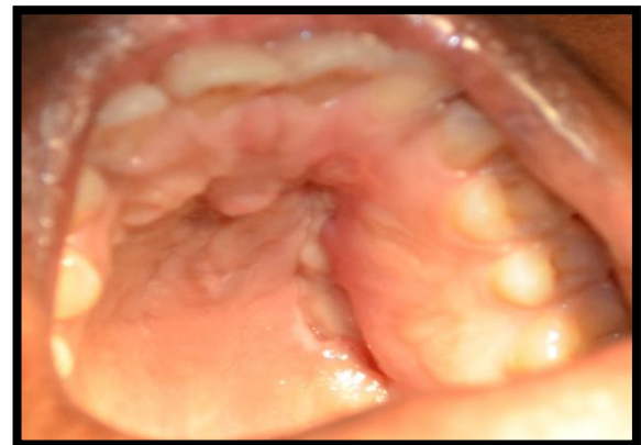
Fig-10: Follow up of the patient 2 weeks after the administration of the medication shows resolving of the purulent discharge