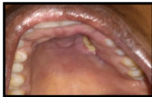
Fig-3: Lesion seen on the left side of the palate