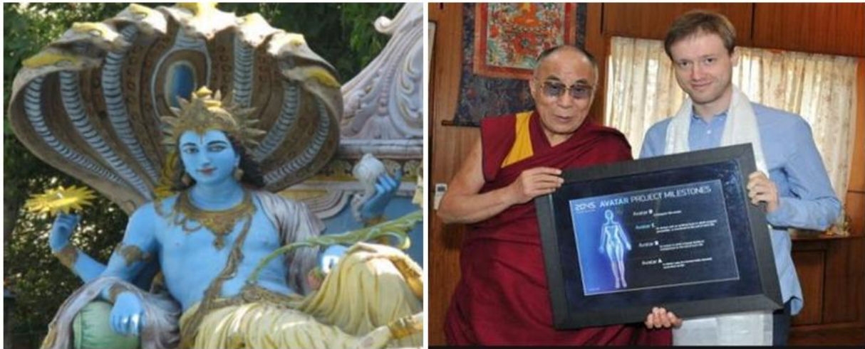
Fig-10: Dalai Lama promotes Avatars

The evidences indicate that not only USA but also its partner in the space, the Russian Federation, would have a human robotization project in development in Tibet: send Tibetan colonies into space and build a cyborg army. Russia would also have a program of illegal human experimentation in Tibet to build cyborgs similar to the one from the United States since the Ministry of Education and Sciences of Russia also promotes the 2045 Avatar project (Fig-10).