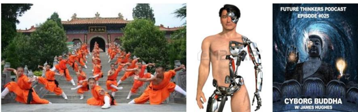
Fig-4: Buddhist monks: The target of USA Cyborg project

The following characteristic of the Buddhist monks that probably attracts the MIT and the transnational technology companies is the Buddhist monk sexuality, for them the sexual activity is totally forbidden by the code of Vinaya; this aspect is important since a cyborg must not have sexual activity, it must be at complete disposal of its owner, for that reason, the cyborg project implies castration and erection control. The absence of sexual activity fits with the cyborg project; the situation of the cyborg imitates the old eunuchs, guardians of the harem. The suspicion is reinforced by recent researches that reveal that the American universities and the Bill Gates Foundation are developing weapons to destroy sperm [33], for that reason, the unfortunate destiny of the victims chosen to be cyborgs is that they will be castrated and without sexual activity (Fig-4).