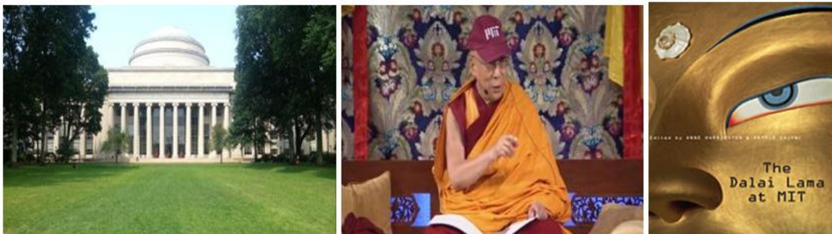
Fig-2: The Dalai Lama at MIT

“The Center was founded to honor the vision of the Fourteenth Dalai Lama and his call for a holistic education that includes the development of human and global ethics” [9].