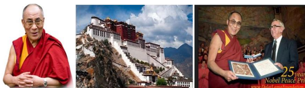
Fig-1: Dalai Lama: Highest political and spiritual authority from the Tibet

The relation of the Dalai Lama with the USA political establishment is known, however, the unusual relation of the Dalai Lama with the Massachusetts Institute of Technology (MIT) [3-5] and the US neuroscience is little known (Fig-1).