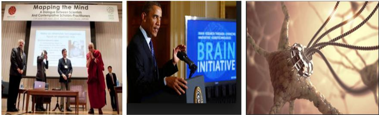
Fig-8: Mapping the mind: Dalai Lama and The White house

The Dalai Lama in a lecture about the human brain map (Left) Dalai Lama has strong relations with the White House that organize The BRAIN initiative. It was announced by Barack Obama. (Center) Recent research alert that it is an camouflaged mind control program with brain nanobots (Right)