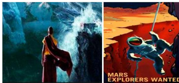
Fig-3: From Buddhist Monks to Mars astronauts-robots

Tibetan monks would be the ideal candidates to use them as settlers-astronauts in Mars exploration. Tibet is the Earth highest region, with an average altitude of 4.900 meters, one of the most noteworthy characteristics of Tibet inhabitants is this adaptation to high altitudes (20) ; the Chinese Tibetans and the Peruvian Quechuas are the inhabitants living in the world's highest elevation zones; they have developed physiological adaptation mechanisms that allow them to survive in zones with hypoxia, like those of space exploration, for that reason, it is suspected that NASA has a secret plan to send Buddhist monks as forced space settlers. This suspicion about developing of human robots in Tibet for NASA is reinforced by the script of some "Star Wars" saga films where the aliens use the Tibetan language [21]. Although science fiction films arguments are generally attributed to the creativity of their writers and producers, most analysts of science fiction films are not aware that the real argument of many films is based on secret and illicit human experiments developed by US army and CIA in the world [22-25]. Thus, paradoxically the series of science fiction created for scientific desinformation with a objective scientific analysis can become involuntary libraries of this secret science that American Stablism and its media hides to the world society (Fig-3) [25].