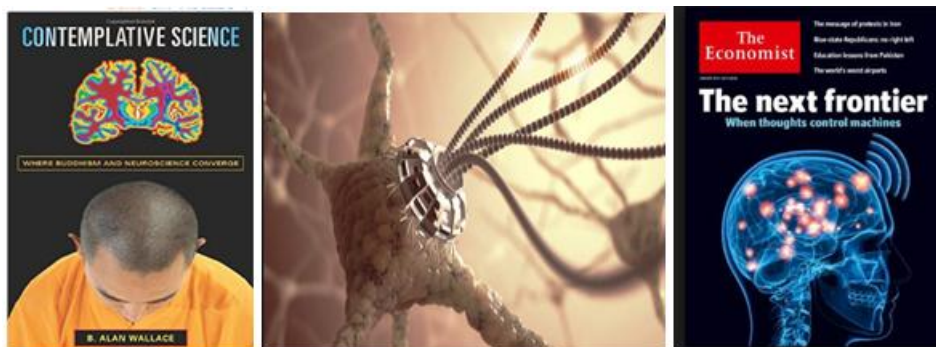
Fig-7: The secret of Contemplative science: brain nanobots

Right: How Far Away Is Memory Implantation? Disponible en: http://www.33rdsquare.com/2013/11/how-far-away-is-memory-implantation.html ory Implantation?