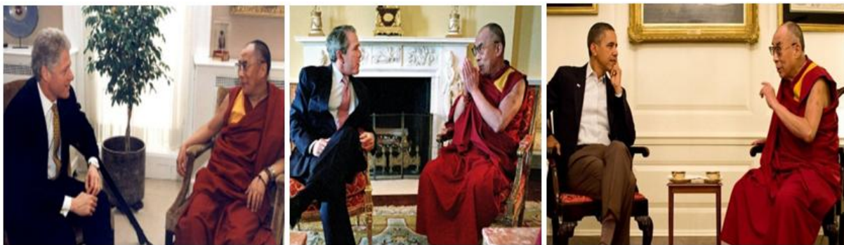
Fig-5: Dalai Lama in the White house

CIA is the main organizer of mind control programs in the world. Mind control is the key of human robotization, The first known participation by the CIA was in 1950 with the launch of Project Bluebird, however the main program was MKULTRA. It was a program designed to perform the largest mind control experiment, an illegal and clandestine program of experiments on human subjects. The experiment included the participation of scientists and 80 renowned institutions, among them 44 schools, prestigious universities like Harvard, Stanford and Yale, 12 hospitals, and pharmaceutical companies, and jails. Nowadays, recent researches give evidences of a classified US global mind control weapon program in the world with invasive neurotechnology [31], thus the real interest of the American universities in the Tibetan monks aims to develop a program of mind control in Tibet (Fig-5).