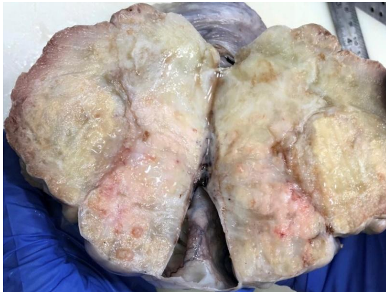
Fig-2: Cut section reveals yellowish white firm solid and Cystic areas