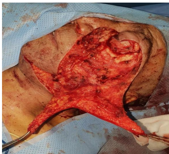
Fig-2: Picture of anterior bilobed cheek flap