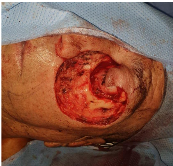
Fig-1: cheek skin defect after tumor resection