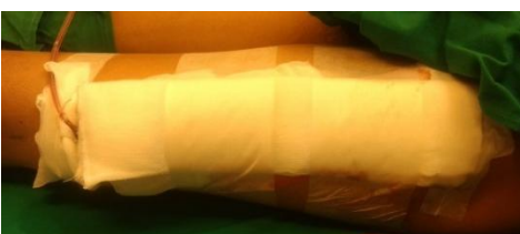
Fig-3: Graft site