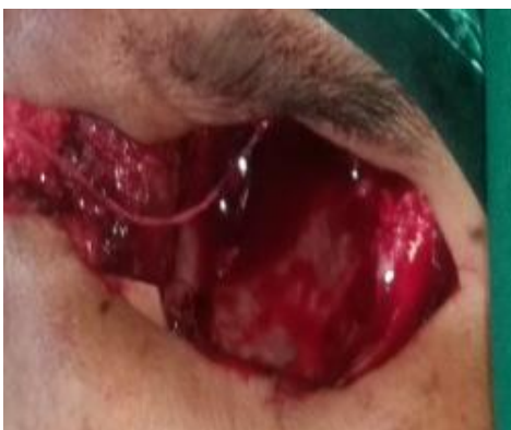
Fig-2: After complete surgical resection