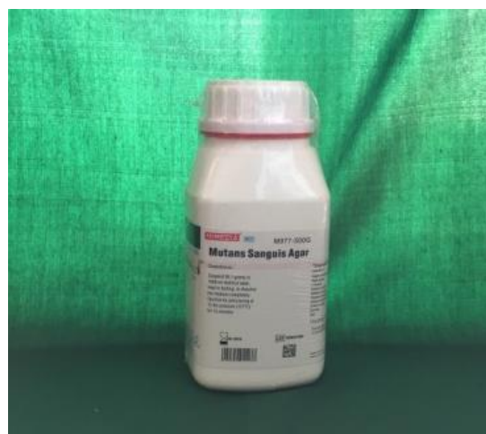
Mutans Sanguis Agar