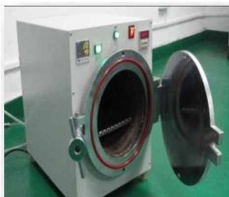
Petridishes Placed Inside Incubator