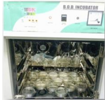
Petridishes Placed Inside Incubator