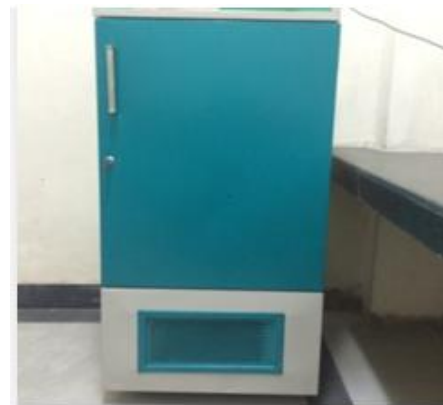
Solidification of Agar Medium in Laminar Air Flow