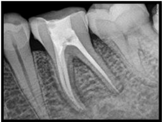
Fig-7: Post-op radiograph

Obturation was completed using gutta percha (Fig 7). Post endodontic restoration was completed using full coverage metal crown (Fig 8). The patient remained asymptomatic during the 3 month follow up visit.