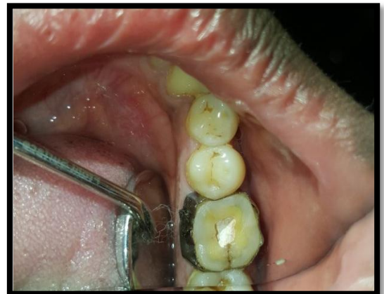
Fig-4: Orthodontic band placement

Orthodontic band was placed to stabilize the tooth and prevent further propagation of crack (Fig 4). This also helps to reinforce tooth during biomechanical preparation. On the second visit, cleaning and shaping was done (Fig 5) and master cone selected (Fig 6).