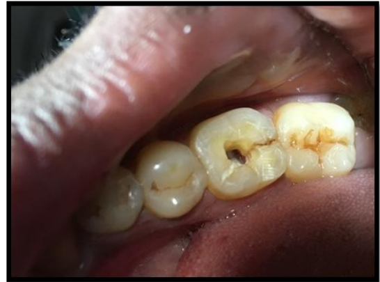
Fig-3: Access cavity preparation

diagnosis was symptomatic apical periodontitis due to cracked tooth. On the first visit, access cavity was prepared on 36 which revealed crack line extending upto pulpal floor (Fig 3).