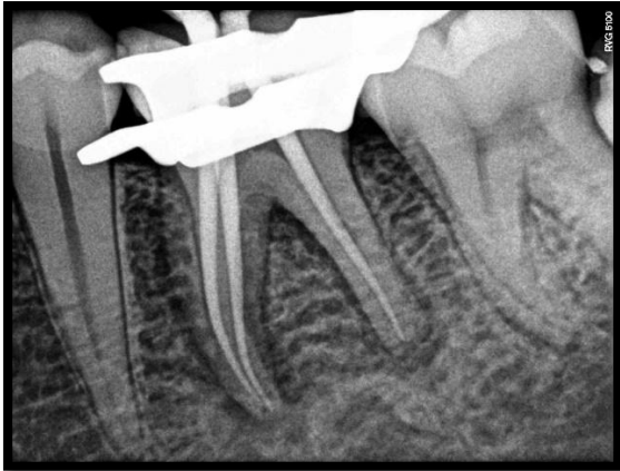
Fig-6: Master cone selected

Obturation was completed using gutta percha (Fig 7). Post endodontic restoration was completed using full coverage metal crown (Fig 8). The patient remained asymptomatic during the 3 month follow up visit.