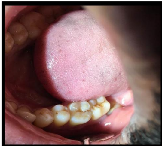
Fig-1: Pre-op photograph

A 32 year old male patient reported to the Department of Conservative Dentistry and Endodontics with complaint of severe pain in lower left posterior region of mouth on chewing food. Pain had started three weeks back which aggravated on chewing food and lasted for more than ten minutes. Spontaneous and diffuse type of pain was felt on the left side of face. Patient was unable to localize the area. Clinical examination revealed deep groove on distal aspect of the occlusal surface on tooth number 36 (Fig1).