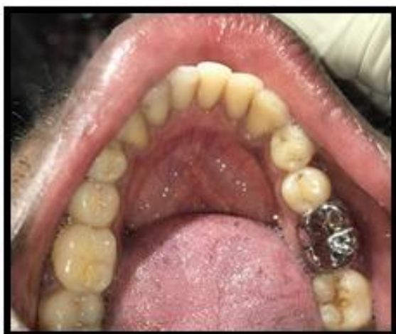
Fig-8: Metal crown cementation