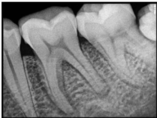
Fig-2: Pre-op radiograph

Tooth number 36 showed widening of PDL space on radiographic examination (Fig 2). Bite test performed using wooden stick elicited pain on releasing bite pressure. Based on the above findings, the