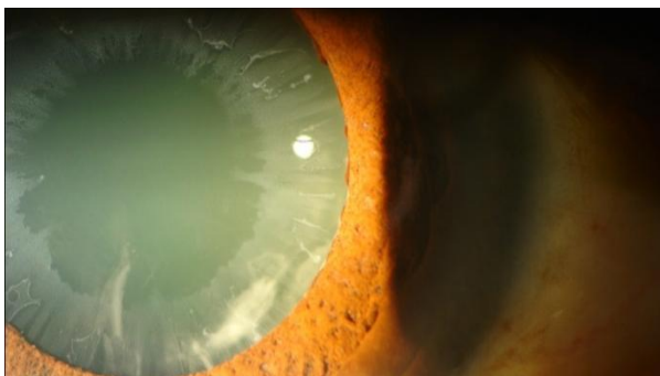
Fig-1: An eye with PXS showing the dandruff like pseudoexfoliation material on the surface of the cataractous lens capsule

Finally, the results were presented in tables and figures.