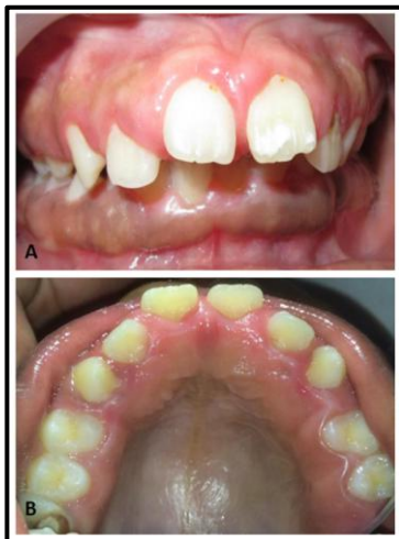
Fig-2: Shows A) Generalized gingival hyperplasia B) High arched Palate

On intraoral examination, the patient presented with marked generalized upper gingival hyperplasia with a high arched palate. Gingival tissue was pale pink in colour with firm and resilient consistency. The loss of contour in gingival tissue was also noted (Figure 2). Gingival tissue illustrates minimal bleeding on probing and did not show any release of exudates. Papilla penetrating type frenum was seen. On occlusal analysis, patient had a class II canine relation with prognathic maxilla along with generalized spacing, increased overjet and deep bite (Figure 3).