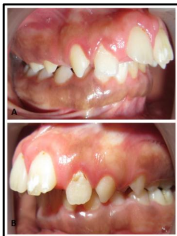
Fig-3: Right & Left lateral view shows prognathic Maxilla with spacing

Presence of 6 supernumerary teeth S_1(13,14) ; S_2(15,16) ; S_3(22,23) ; S_4(24,25) ; S_5(42,43) ; S_6(43,44) was exhibited by using Orthopantomogram (Figure 4). Hematological analysis revealed that all the parameters were within physiological limits. Genetic karyotyping shows normal.