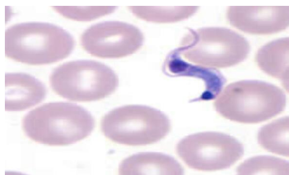
Fig-3: Blood Film with Giemsa Stain (Positive Sample)