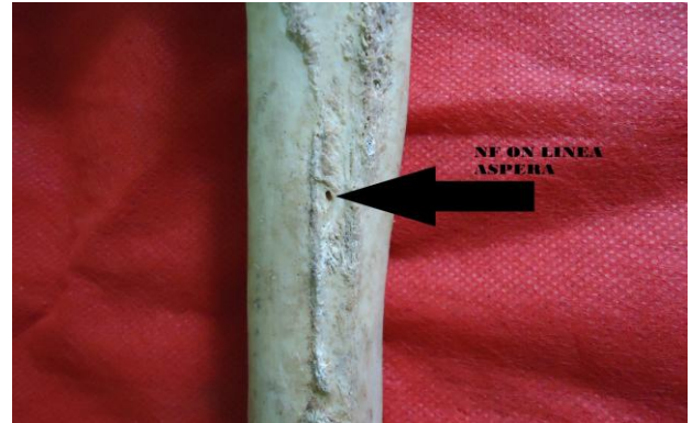
Fig-3: Nutrient foramen on linea aspera