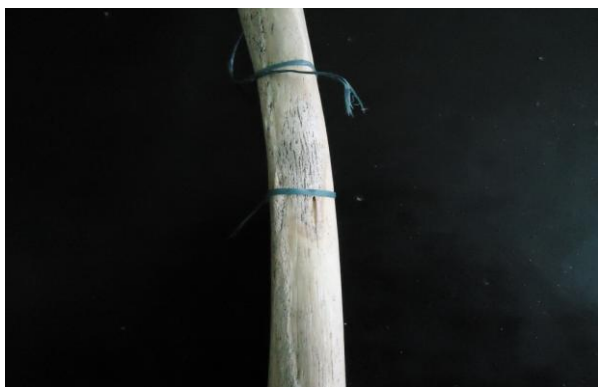
Fig-2: Double nutrient foramen