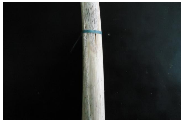
Fig-4: Nutrient foramen on lateral surface of femur