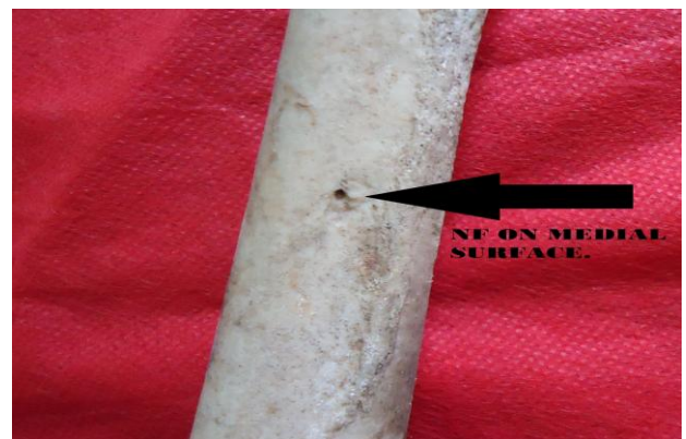
Fig-5: Nutrient foramen on medial surface of femur