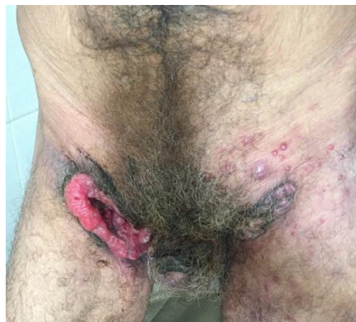
Fig-2: An ulceroburging tumor of the right inguinal area