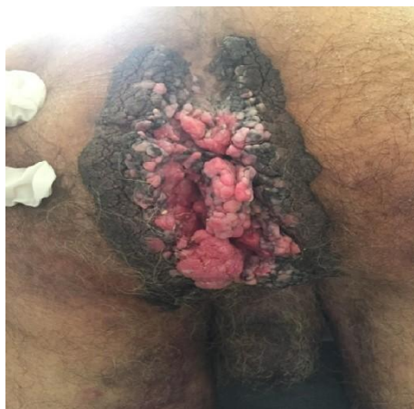
Fig-1: Cauliflower-shaped tumor of the anal margining