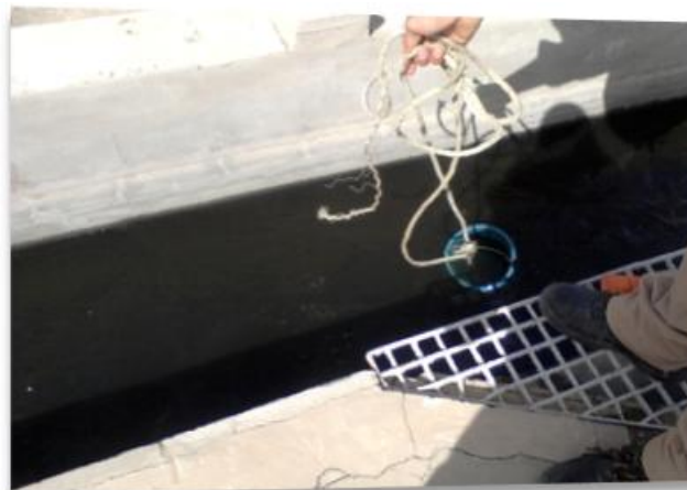
Fig-1: Sampling, sampling and analyzes