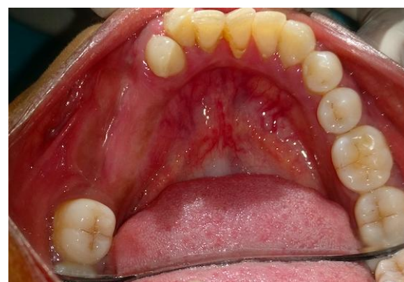
Fig-2b: Diffuse bicortical expansion (occlusal view)