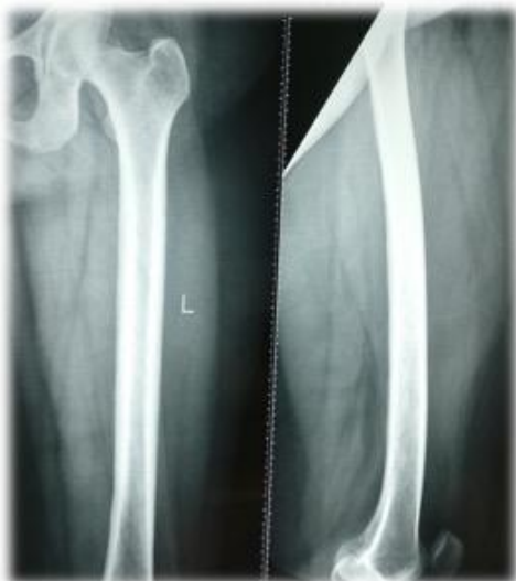
Fig-4b: X-ray of Femur