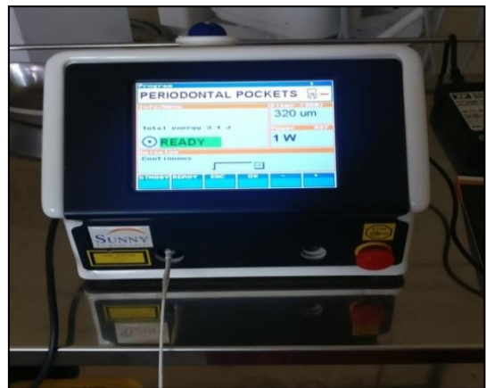
Fig-5a: Diode LASER Unit