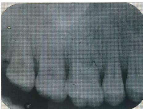
Fig-6b: 6 months follow up