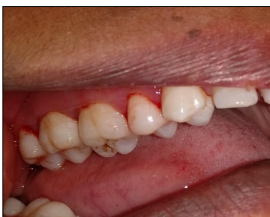
Fig-5d: Immediate Post Operative