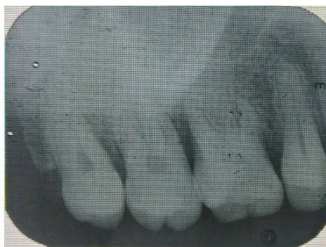
Fig-6a: 3 months follow up