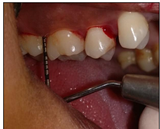
Fig-5b: 6mm probing depth (16)