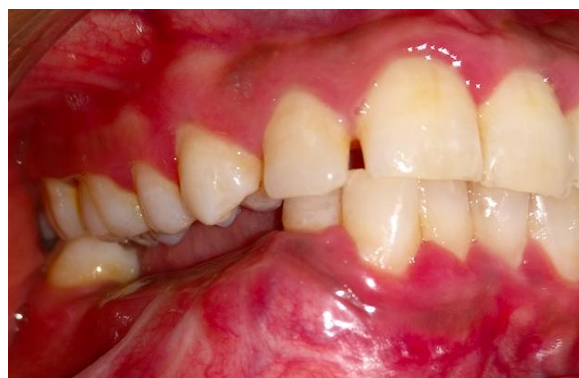
Fig-2a: Diffuse bicortical expansion (lateral view)