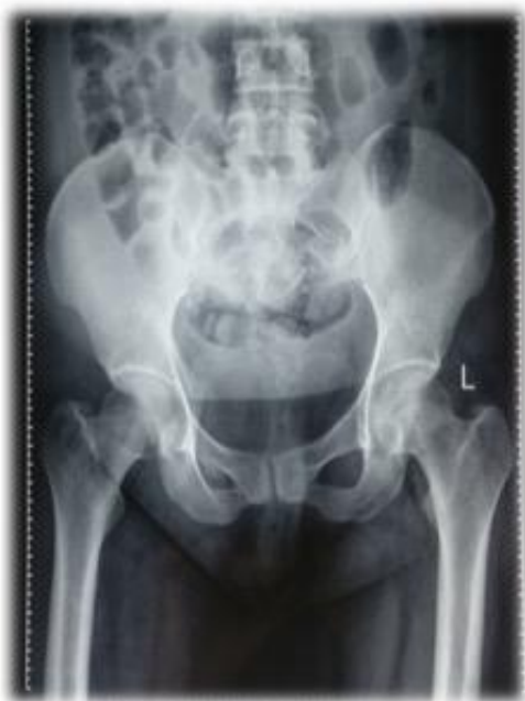
Fig-4a: X-ray of Hip