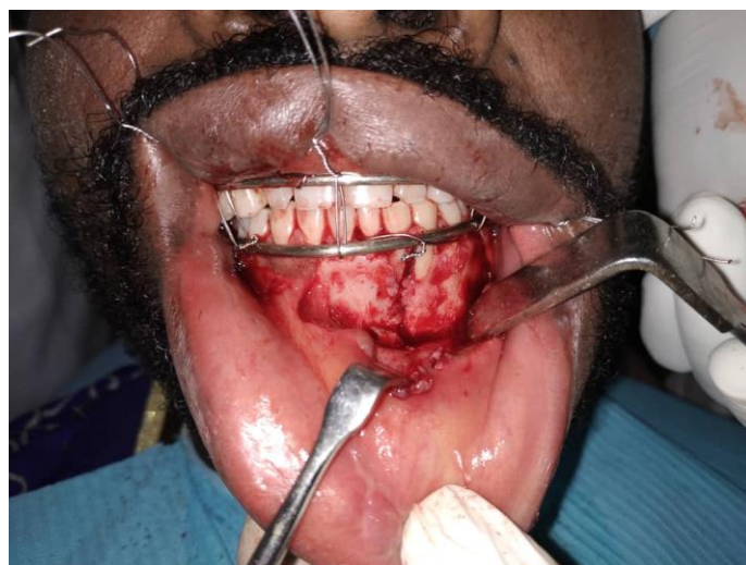
Fig-4: Close reduction of Left Mandibular parasymphyseal fracture with arch bars