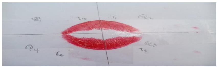
Fig-1: The lip print pattern of a female non-identical twin