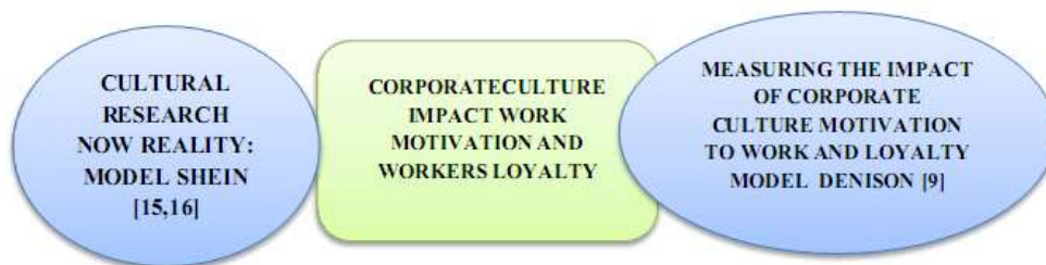
Fig-2: Research Approach

In terms of content, the thesis focuses overcome the limitations of previous research through in-depth analysis of the contents are as follows: (1) Situation Analysis Corporate culture away from the factors that influence to the level currently Corporate culture; (2) Analysis of the impact of each factor Corporate culture up work motivation; (3) Analysis of the impact of the Corporate culture loyalty to the workers; (4) Analysis of the relationship between motivation effects work and loyalty in the index; (5) To focus on building advanced system solutions for