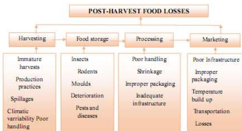
Fig-2: Causes of Losses at the various post-harvest stages

losses as a result of biological and environmental reasons and above all fluctuating climatic conditions, the major causes are socio-economic reasons such as attack from pests and diseases due to poor quality of storage facilities, limited technology, poor road networks, and inadequate training and information (Figure 2).