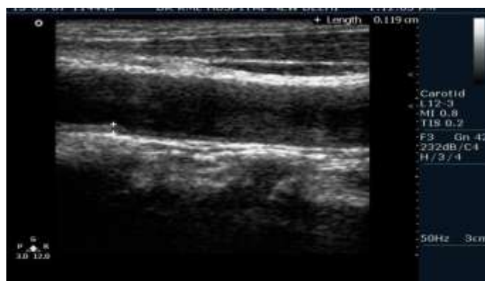
Fig-1: Carotid Intima Media Thickness by B mode ultrasonography

CIMT was measured by B-mode ultrasonography on Philips HD 11 by transducer L12-3 MHz by a single radiologist who was blind to the clinical characteristics of the patients. We confined the IMT measurements to common carotid artery (CCA) of both left and right side. To access CCA-IMT, we focused on far-wall IMT, which is defined as the distance between the leading edge of the lumen-intima interface and the leading edge of the media-adventitia interface. Far wall IMTs of both CCAs was measured at three sites(thickest point, and at sites 1cm upstream and downstream). The mean IMT of the carotid arteries was assessed. The mean CCA-IMT was defined as the mean IMT of the right and the left CCAs calculated from 3 measurements on each side. If uniform intimal thickening in the CCA was found, we measured IMT every 1 cm from the bifurcation to the end of CCA, and then took three measurements at the thickest point, 1cm upstream and 1 cm downstream [10]. CIMT >0.8 mm was considered abnormal [11] (figure 1).