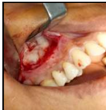
Fig-2: Creation of bony window in maxillary sinus

Radiograph was taken to locate the displaced root into right maxillary sinus. We planned for retrieval of root from right maxillary sinus through Caldwell luc surgery under local anesthesia.