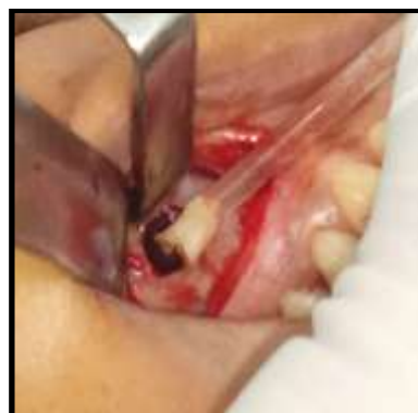
Fig-3: Retrieval of displaced root using suction catheter

We found there was accumulation of pus into the maxillary sinus. Pus drainage was done through the bony window created through suction tip. Root tip was mobile but we found difficulty in retrieving the root with the metal suction tip because the root was not in a straight line access with the sinus window. Hence we used a new innovative technique of using a suction catheter for retrieving the root (fig. 3). Due to high suction pressure and flexibility of the suction catheter the displaced root was retrieved easily.