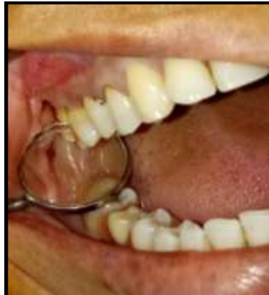
Fig-1: Extraction socket of 17 completely healed

On extra oral examination there was tenderness over the right cheek region. Intra orally the extraction site was completely healed (fig. 1).