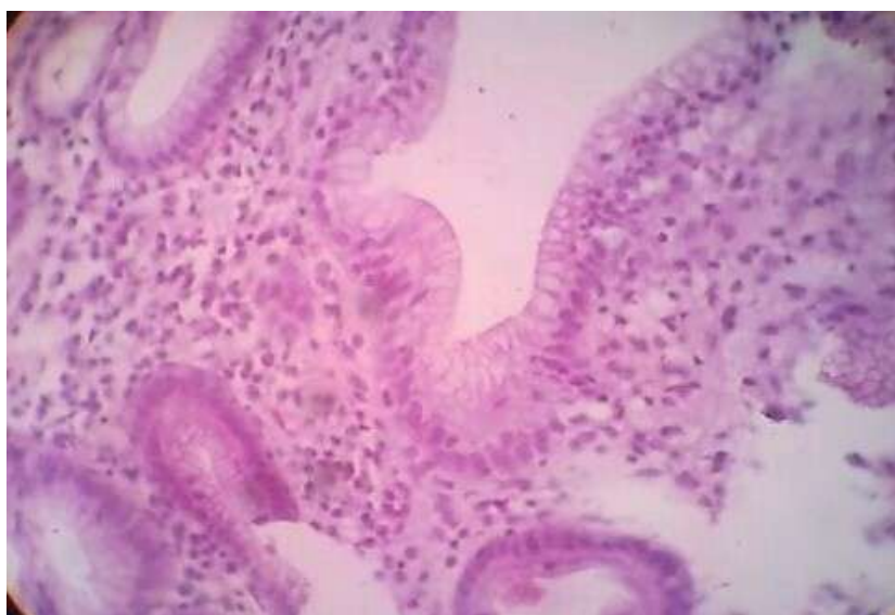
Fig-2: Sections showing aggregates of foamy macrophages and histiocytes in lamina propria and submucosa displaying eccentric round small vesicular nuclei and abundant foamy cytoplasm .H&E (40x)