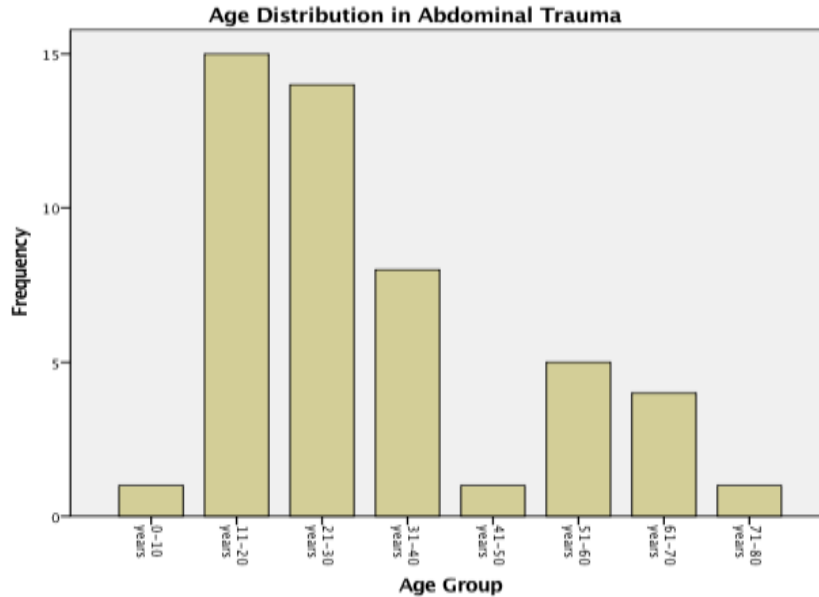
Fig-1: Age distribution in abdominal trauma

decade of life [2]. Baradaran et al. in their series found 87% of their penetrating abdominal trauma patients were aged from 15-44 years old [3].