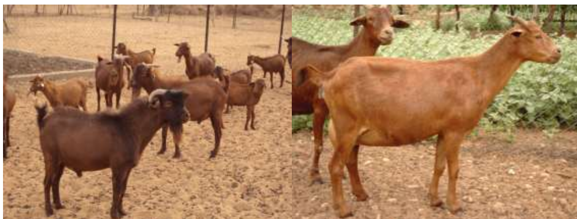
Fig-5: Maradi red goat [73]

According to [69], the Maradi goat is incorrectly described as red (Figure 5). The coat is uniform light brown in color with narrow hairs, shiny with mahogany reflection [53]. It is this phenotype that has been selected by the goat breeding center of Maradi as part of its selection and distribution. In the Sokoto region, the coat is usually deep red [70] with an upper line of the body from head to tail marked by a black stripe. The forehead, the tail, the extremities of the limbs is also dark. Opinions remain divided on the causes of these shades of the dress. Some advance genes in pigment synthesis. Others see it as the result of the interaction of genera and environment [71].