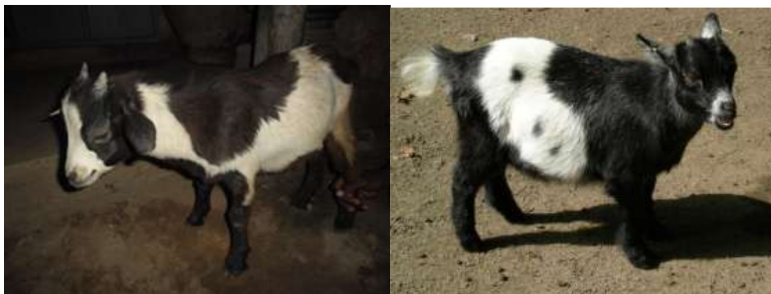
Fig-3: Dwarf goats or Djallonke

very varied. As in other countries [48] there are fawn, gray, black or mixed-colored individuals. They are stocky and small animals. Males weigh on average 20-25 kg and have a height at the withers of 53.25 \pm 4.5 cm. Females reach an average of 15 to 25 kg and measure 49.25 \pm 3.09 cm at the withers. As you go down to the far south of the country, even smaller varieties are encountered. Their size is smaller than that of the Maradi red goat (55 vs 65 cm), but of the same size as those found in other Central African countries [48].