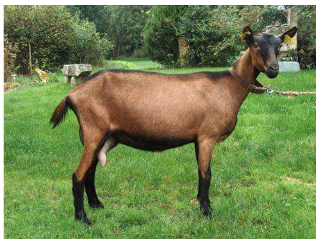
Fig-6: Alpine Goat [73]

production still exclusively bovine. They have been raised on this farm since 2005.