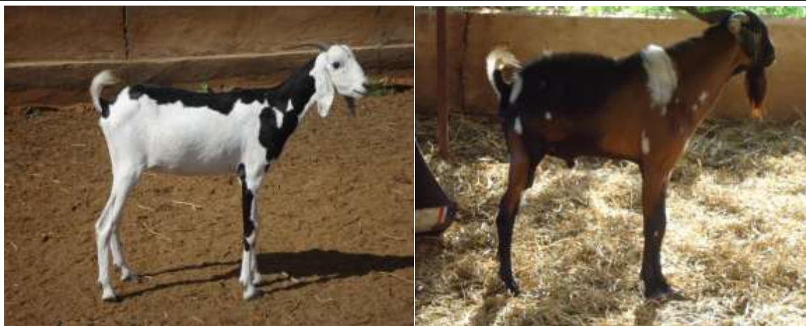
Fig-4: Sahelian Goat [64]