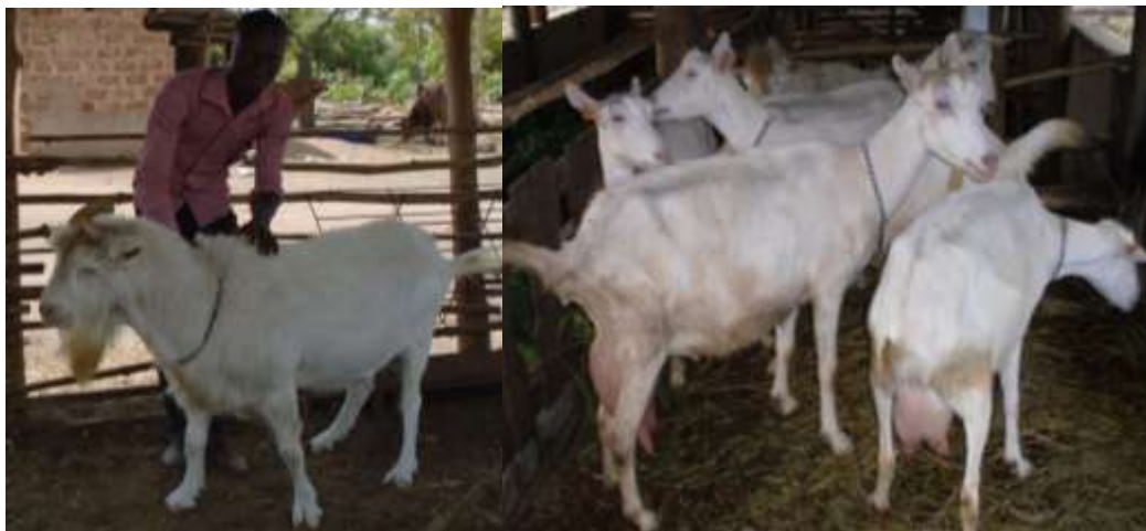
Fig-7: Saanen goats