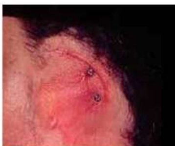
Photograph No. 10: The implants emerging in the skin