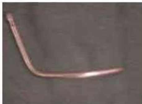
Photograph No. 14: The titanium Prosthesis is made following the forms and individual measurements