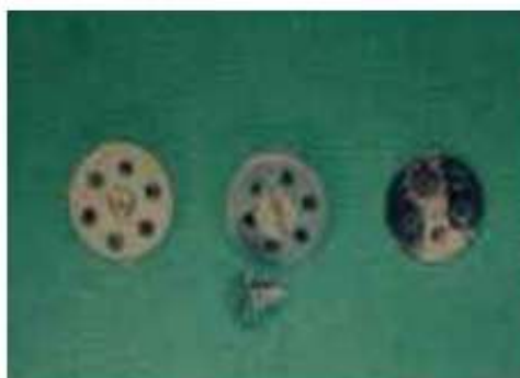
Photograph No. 7: The Implants should be short and to get the maximum contact with temporal bone, a perforated fin has been manufactured

In this way it has been possible to eliminate the facial defect and eliminate all kinds of complexes that our patient may have.