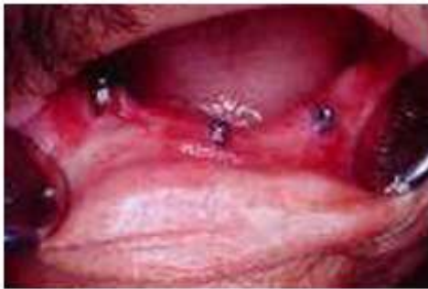
Photograph No. 3: Implants Emerging in the oral cavity