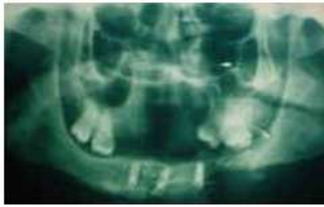
Photograph No. 2: The more similar bone is the rib. We manufacture three implants for it