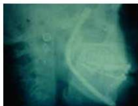
Photograph No. 15: The prosthesis located in correct position

In photographs No. 12 and No. 13, we can see the prosthesis made for a patient with total loss of the jaw and radiography when it has been positioned.