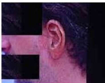
Photograph No. 11: The prosthesis in position

In photograph number 7 we can see the type of implants that are made for this patient. Given that they are implants made for the temporal bone, they will be designed very short taking into account the thickness of the temporal bone by means of the tomography, they present, as already said, a type of fin with six perforations that will be in contact with the temporal bone once positioned.