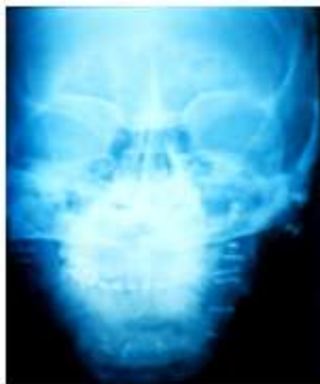
Photograph No. 9: The X-Ray shows the implants placed in temporal bone