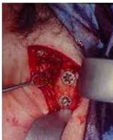
Photograph No. 8: Only two implants are enough to make the prosthesis