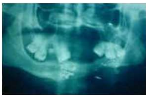
Photograph No. 1: The lack of the body of the mandible

This patient did not have the conventional long and wide implants since they were not the ones indicated and that is why some devices were manufactured with special measures that fulfilled their purpose of being placed in the thickness of a rib and being able to receive phase two, an artificial stump [4-9].