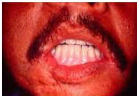
Photograph No. 6: The actual appearance

In Photograph No. 5 the bar in position, made to measure and in the buccal area. In photograph No. 6, we appreciate the total reconstruction of the patient and his appearance after having made a prosthesis in a directed way.