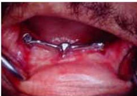
Photograph No. 5: The Tangential bar is correctly placed in the mouth

We can clearly see in Photograph No. 1, the lack of the mandibular body and the state in which the patient is presented looking for our professional help.