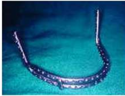
Photograph No. 12: A complete titanium mandible is constructed