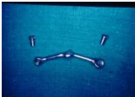
Photograph No. 4: The Tangential bar has been made