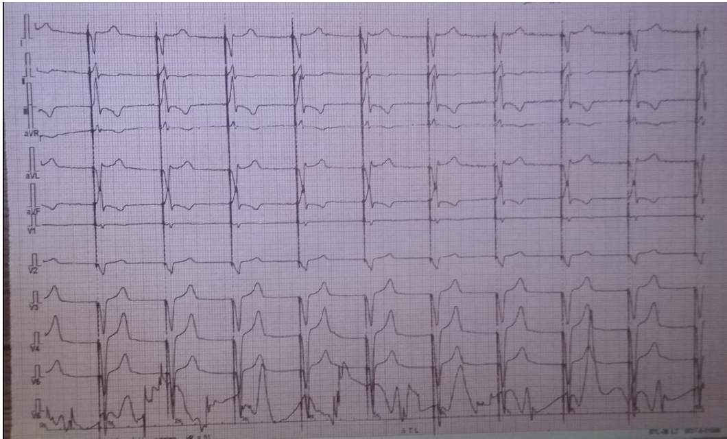
Fig-1: 12 lead ECG showing paced rhythm at 60 bpm