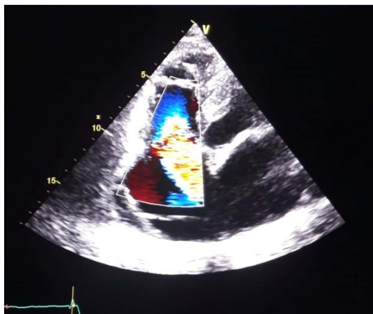
Fig-3: Transthoracic echocardiography showing massive tricuspid insufficiency