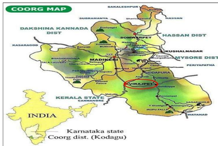
Fig-3: Map showing Coorg district

dental college. The proportion of patients living in each of these concentric areas is recorded. The data analysis was based on distance from college and age of patients receiving treatment at the institution. Age groups included are 0-20 years, 21-40 years, 41-60 years, 61- 80 years and 80 and above.